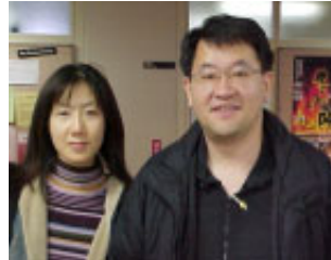
A visit to campus in Feb. 2003