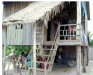
Typical village house

The wooden houses are two story structure so as to prevent moisture from coming in. At every house, we were welcomed by the shining smiles of boys and girls which I will never forget. Mothers were so kind to have served us sliced mangos and a glass of tea, which quenched our thirst so much.