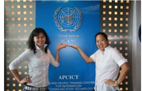
An IUJer interning in Korea with the UNAPCICT for the first time this summer!

International University of Japan Graduate School of International Relations MA, International Development MA, International Peace Studies MA, International Relations