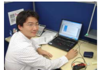
An IUJ student interns at AI Capital in Tokyo - a new internship slot for IUJ this year.

AEON ANA Ford Motors Fuji Xerox, Tokyo Gplus Media IBM Corporate Communications, Indonesia IT and Internet service group JETRO NSK NextView Nissan Motors Riko Kabushiki Gaisha, Dept. of Trade Rohm and Haas SONY Socio-Tech Institute, McCann Erickson TEPCO, Tokyo Electric Power Co.