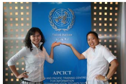
An IUJer interning in Korea with the UNAPCICT for the first time this summer!

International University of Japan Graduate School of International Relations MA, International Development MA, International Peace Studies MA, International Relations