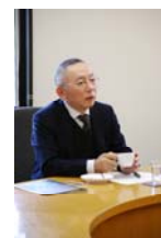
Mr. Tadashi Yanai, Chairman, President and CEO of FastRetailing (Uniqlo) meets students in a roundtable discussion on careers opportunities Fall 2010.

Watch for the exciting Press Release from campus on these efforts, and discover the amazing firms we are partnering with for jobs, internships, research, academic and training programs, new students coming into IUJ and much more.