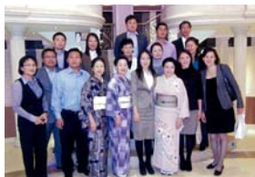
Alumni in Mongolia welcome women from Urasa to their area - Fall 2010